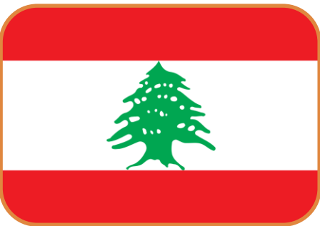
USEK – Lebanese University – Lebanese American University