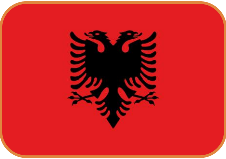
University of Tirana