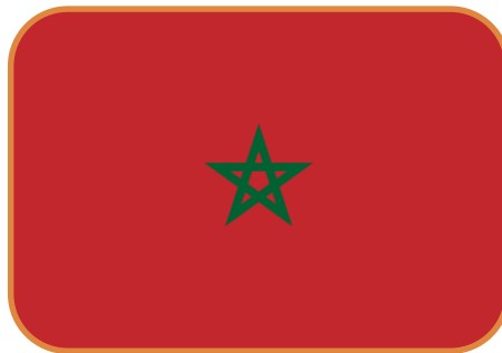
Muhammad V Rabat – IAV Hassan II – Université de Cadi Ayyad - EUFM