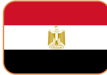
University of Cairo – University of Alexandria – AAST – University of Damanhour