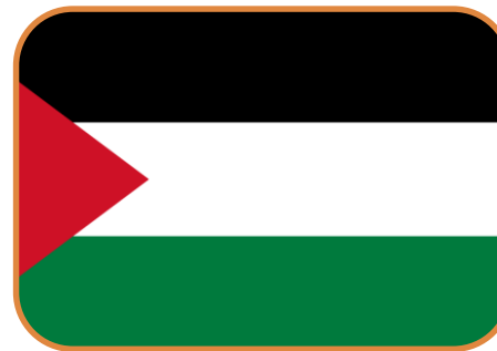
UCAS – An-Najah University – Islamic University of Gaza – Betlrhem University